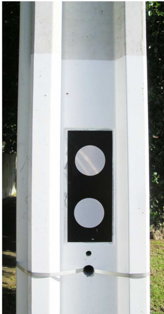
OUR HAZARD MARKER SET IN A CAVITY TO PREVENT REMOVAL