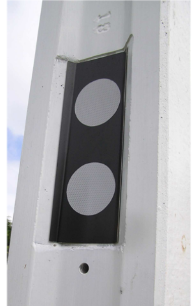
9.5m HAZARD MARKER Part number 210 FORMED TO FIT INSIDE A 9.5 M POLE AND PREVENTS REMOVAL

Our hazard plates are made from treated corrosion resistant aluminium with a stable non-fading well proven UV resistant coating.